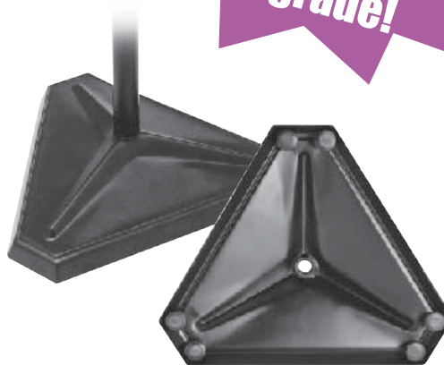
Underside of Base

Our patented HEX-BASE is constructed from 8 lbs. of sheet metal and is designed to eliminate movement when the user steps on the base for unwavering support.